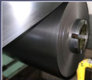
SPHC-PO PLAT ABU-ABU