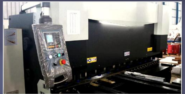
NC HYDRAULIC SHEAR