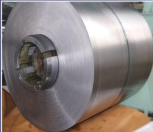
SPCC-SD PLAT PUTIH