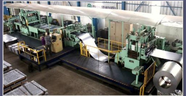
ROTARY SHEAR LEVELLER