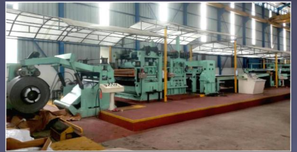
ROTARY SHEAR LINE