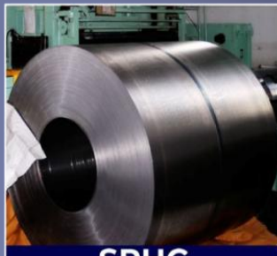
SPHC PLAT HITAM